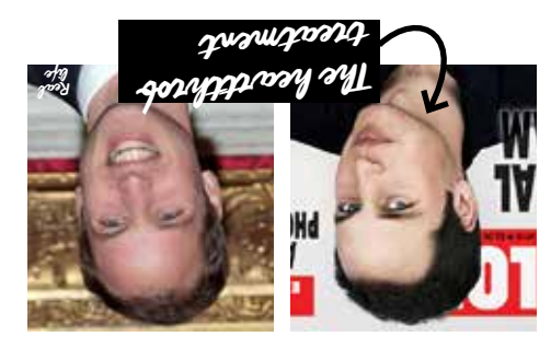
..or like them.